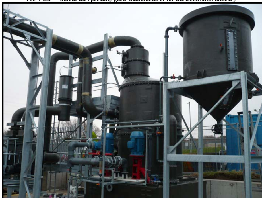
The V-tex™ unit at the speciality gases manufacturer for the electronics industry

ERG treats safety as a prime concern, so all staff are encouraged to work safely at all times and to report any concerns to the appropriate supervisor or line manager. There are many potential hazards that can arise when undertaking site work. ERG staff have recently noticed a number