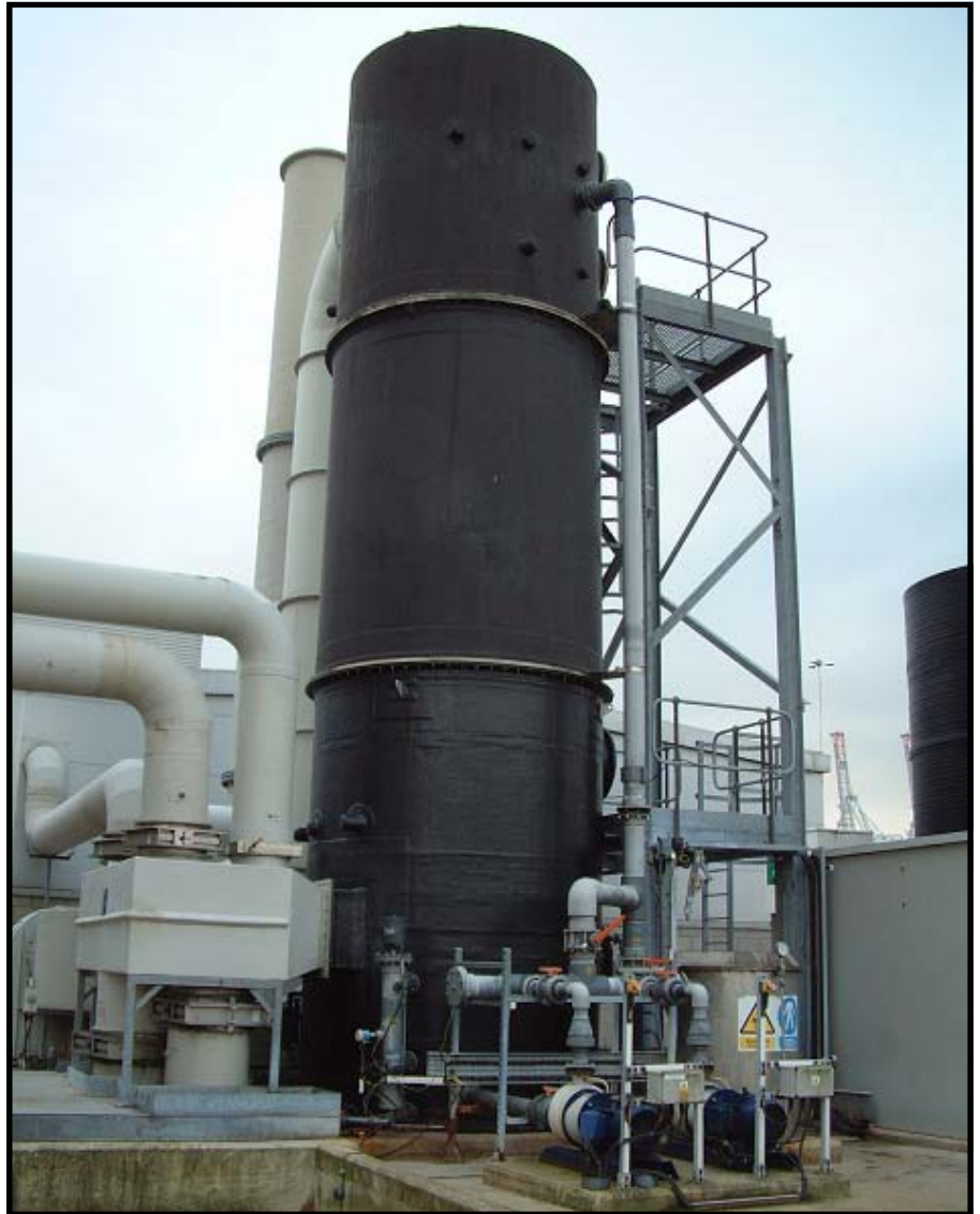
The Millbrook scrubber following refurbishment

services with ERG always working to meet the needs of the client and reduce costs where possible.