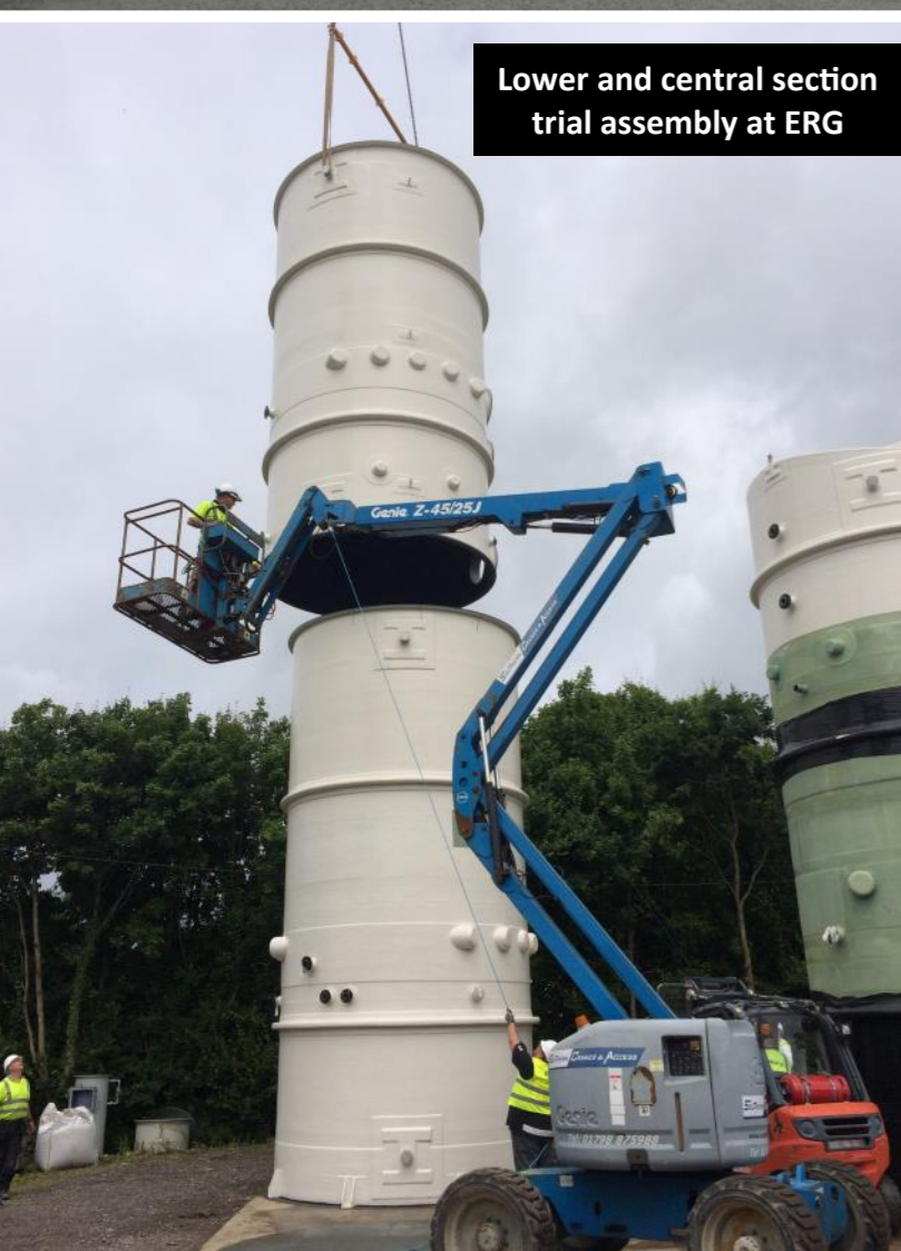
Lower and central section trial assembly at ERG