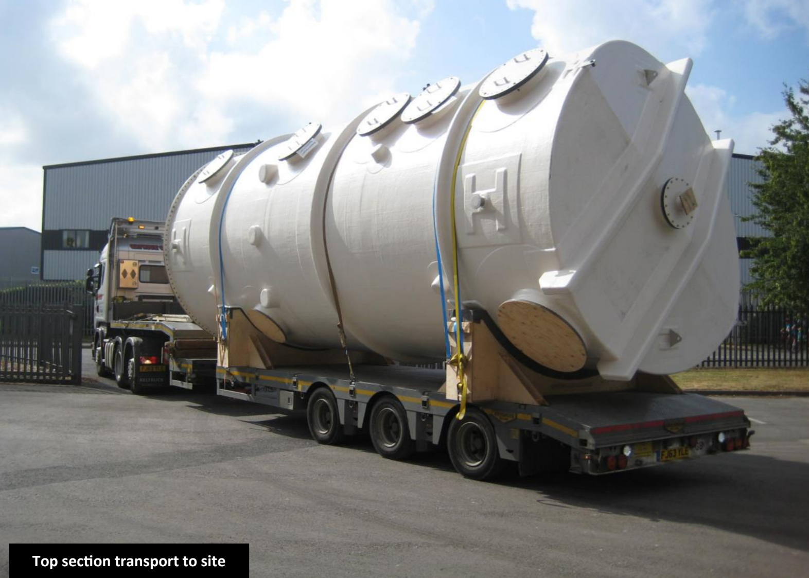
Top section transport to site