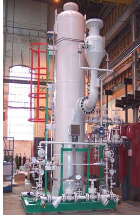
Illustrative particle removal efficiency for ERG Venturi scrubber

Variable throat venturis include adjustable blades in the throat. For variable gas flows these can be automatically modulated to achieve a constant pressure drop ensuring high particulate removal efficiency is maintained independent of flowrate. The mechanism that adjusts the position of the blades is located outside the gas flow and is highly reliable.