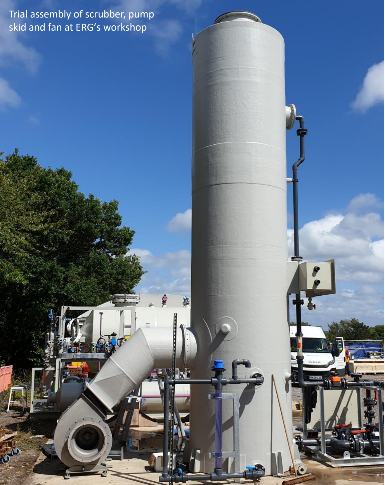
Trial assembly of scrubber, pump skid and fan at ERG's workshop