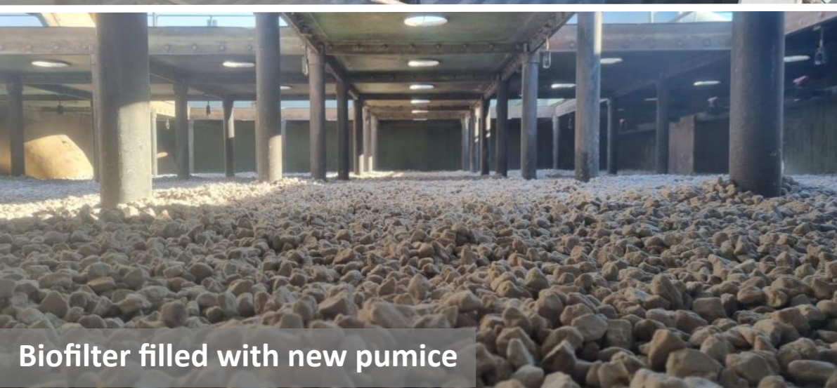
Biofilter filled with new pumice