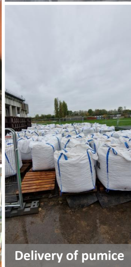
Delivery of pumice