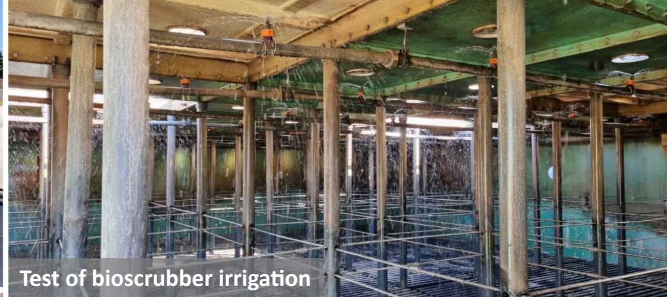
Test of bioscrubber irrigation