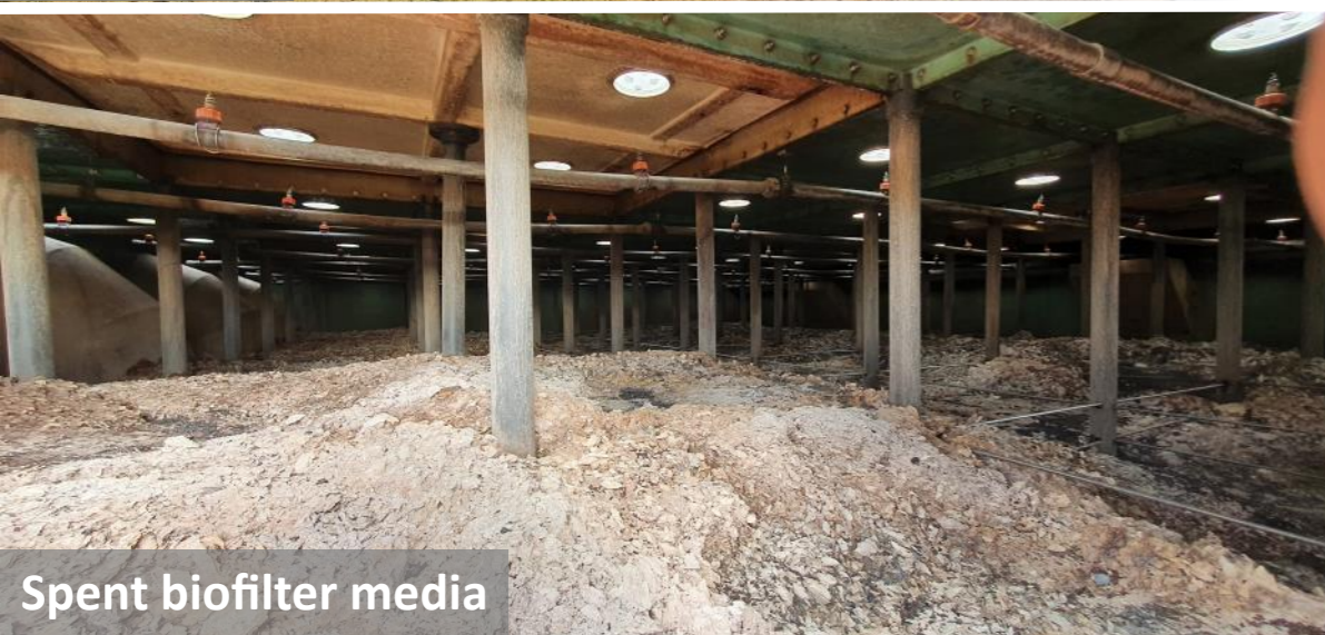
Spent biofilter media